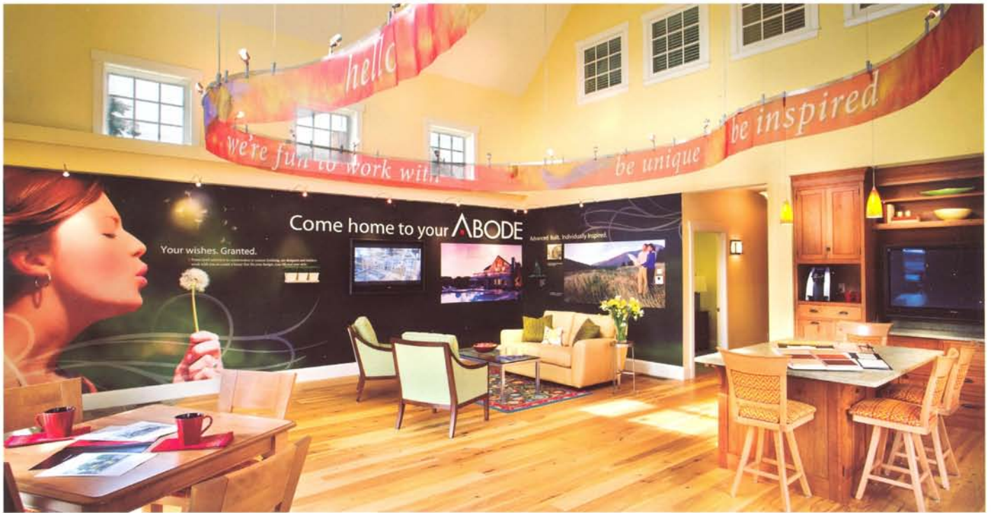
The design center is warm and cozy where you can relax and work with the ABODE team to plan your new home.